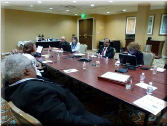
TPM&F BOD Meeting in PO 2015 Conference