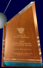
Communications Excellence Award

THERMOPLASTIC MATERIALS AND FOAMS DIVISION